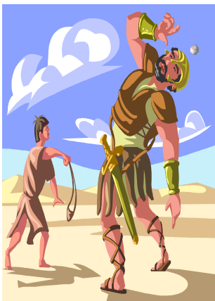
David and his "Smooth Stones" take down Goliath.

WITH SOBRIETY, THE BRAIN CAN BEGIN TO RESTORE SOME LOST FUNCTION.