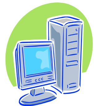
Your computer can help raise money for CalCAP

Although, we have only been connected to "iGive" for a month, $50 dollars has already been raised for CalCAP.